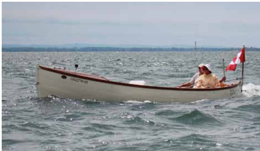
Cruising across the Lake of Two Mountains in Saving Grace.

Mountains to the first lock in the Lachine Canal, which has been refurbished and reopened in 2001. The trip along the canal to the show site was a slower one which allowed all of the boats to travel together. At each lock along the way, crowds gathered and shutters clicked as the passage was recorded.