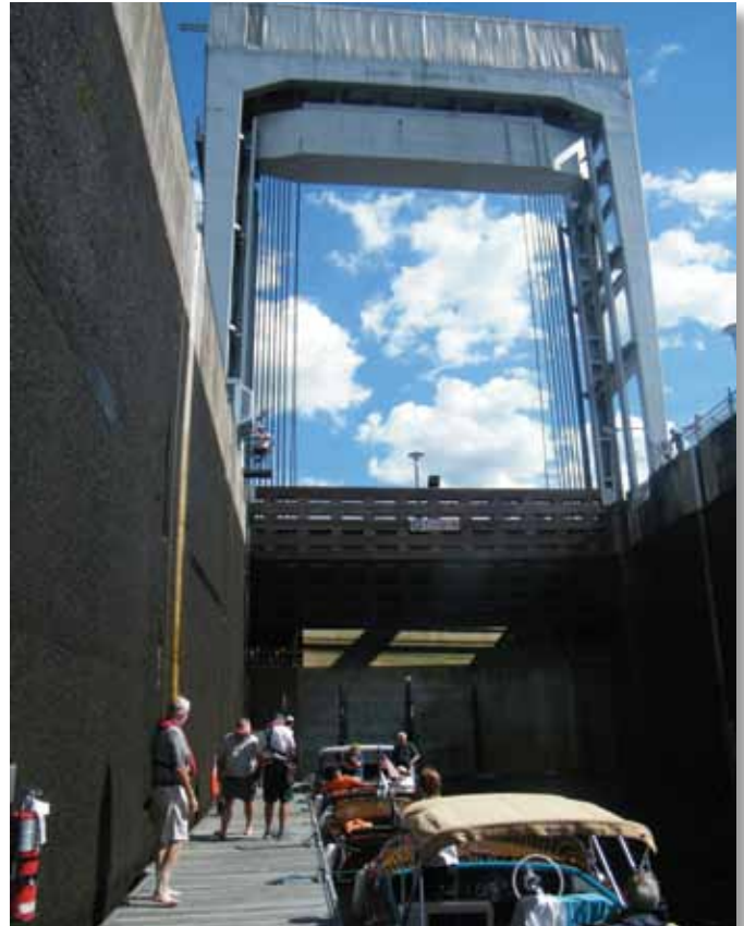
The Carillon Lock with its unique guillotine closing system.