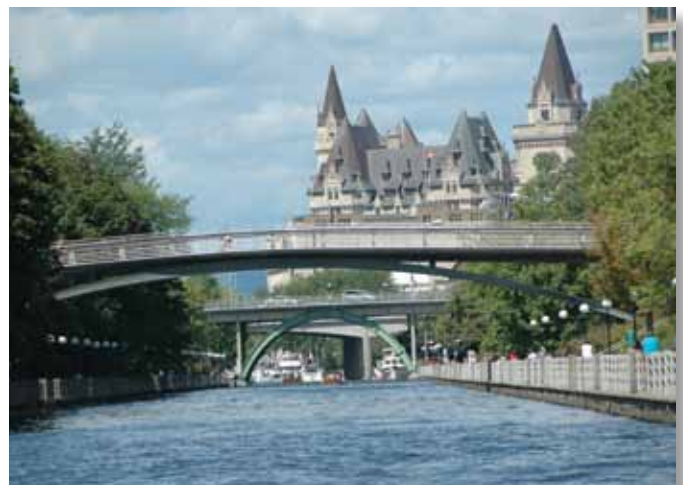
Heading into Ottawa

The pair agreed to contact the High Point attendees first to see if any of them were interested. The invitation went out by email at 10:00 on a Saturday morning. By noon that Monday, they were completely booked and had a waiting list. Because of limited docking facilities at Hudson, Quebec where they would stay on their third night, only fifteen boats could be accommodated on the first leg of the journey. However, two more boats joined them in Hudson, launching on the morning of day four.