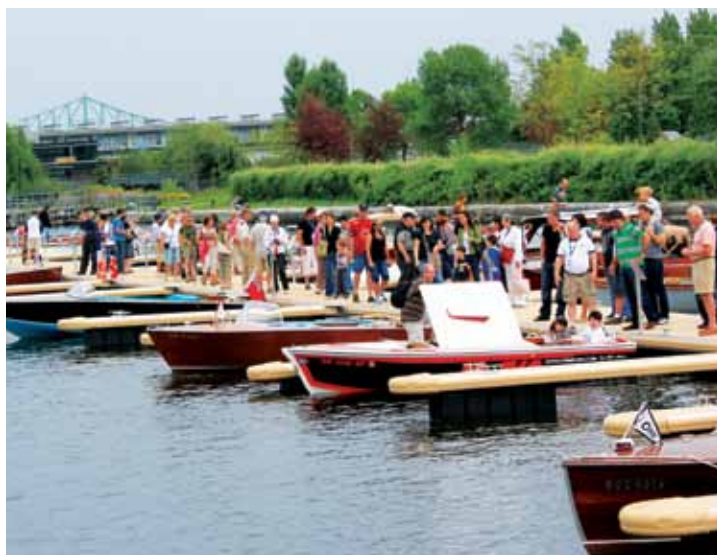
A view of the boat show.

For more photos and videos of the Montreal Classic Boat Festival, visit www.fbcmontreal.com . A professional film crew travelled with the group from Hudson; two of their videos can be seen at http://vimeo.com/15394770 . ❁